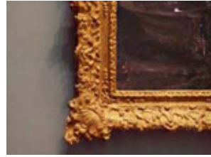
Fine Art & Antiques