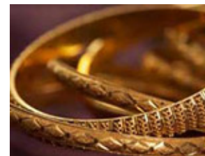
Gold & Precious Metal