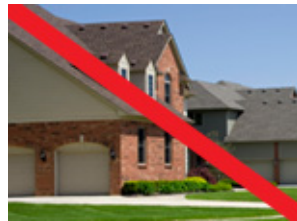
Homes & Property